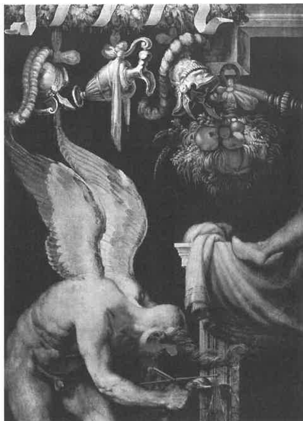
Fig. 3. Caeros

In Greek mythology, Caeros (Greek: Καῖρός) was the personification of opportunity, luck and favourable situations that must be grabbed while one has the chance. He was shown with only one lock of hair. Caeros can be seized by the hair hanging over his face when he arrives. But once he has passed by, no one can grasp him, the back of his head being bald. The moment of action is gone with his hair: a neglected occasion cannot be recovered. He balances scales on a sharp edge, the attribute illustrating the fleeting instant in which occasions appear and disappear. Caeros was the god of the fleeting moment; a favourable opportunity opposing the fate of man. Such a moment must be grasped; otherwise the moment is gone and cannot be re-captured. Caeros can also be related to the principle of serendipity, the "pleasant surprise", the unexpected